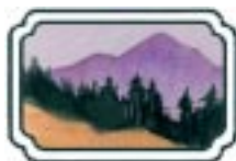
Mt. Tamalpais Interpretive Assn.